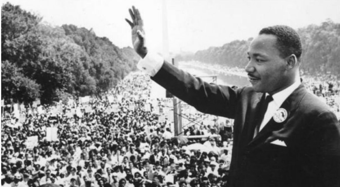
Martin Luther King Jr. in Washington. We remember.